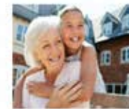
Assisted Living Facility